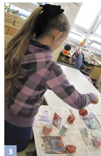
(1) Visiting the mineral collection of the Department of Mineralogy at the Free University Berlin. (2) Designing a poster with the topic “Minerals in Mobile Phones.” (3) Tinkering with and coloring a paper crystal system.

The three-day project took place in June 2013 with 15 pupils aged 10 to 12 years. We started by visiting the mineral collection of the Free University (Fig. 1). From the moment we left the school, the children started picking up little stones from the street, wanting to identify them. At the FU, we showed the children some selected minerals and taught them how they could identify them themselves. Afterwards we chose fantastic mineral aggregates and let the children do the identifying. No problem for these smart kids! Then, we inspected the same minerals under the microscope. How fascinated the children were about how colorful rocks can be. They detected twins and figured out that they change if you turn the microscope stage, and the colors do too. On our way back to school, the children were now able to identify their street rocks by themselves.